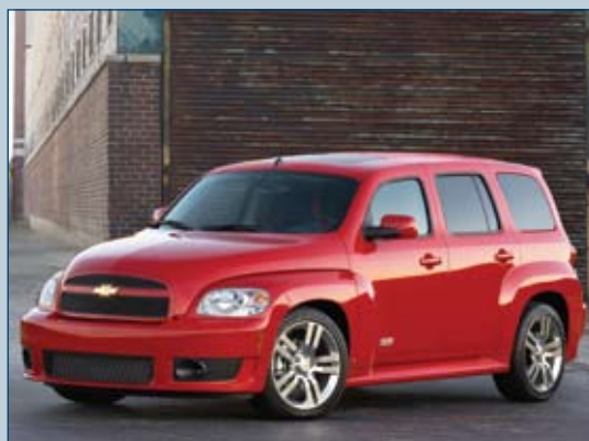
2008 HHR SS