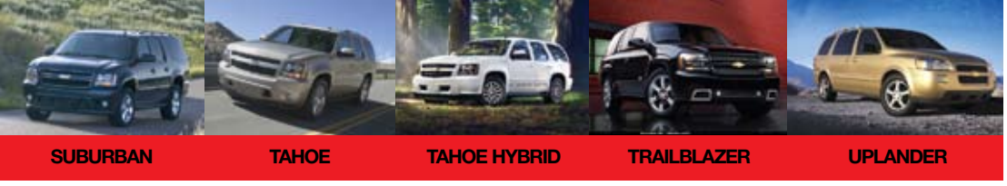
SUBURBAN TAHOE TAHOE HYBRID TRAILBLAZER UPLANDER